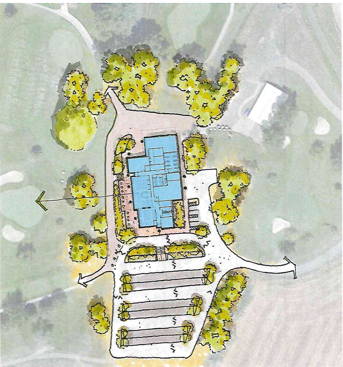
Site Plan Diagram